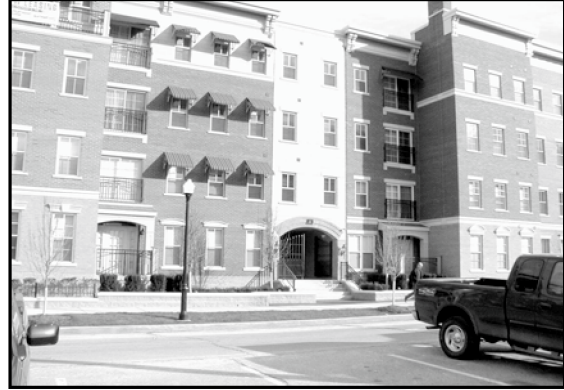
Figure 1405-03-C, D

Section 2. That existing Section 1405-03, “Specific Purposes of Multi-Family Subdistricts,” of the Cincinnati Municipal Code is hereby repealed.