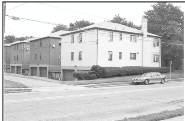
Figure 1405-03-A, B